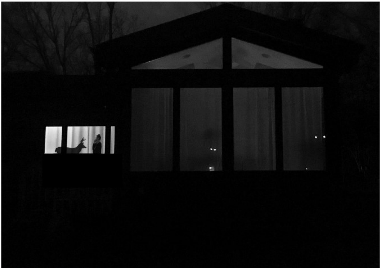
Gina Costa, "Night Stories #5" GINA COSTA

WINCHESTER — The new main show at the Griffin Museum of Photography, “Shootapalooza: A Murmuration of Artists,” consists of work from 48 members of the Shootapalooza photographic collaborative. What they nearly all have in common is a preference for evocation over documentation, mystery rather than explanation, the implicitly surreal over the explicitly real. The interior world, of imagination and dreamscape, predominates over the exterior world, with its solidity and factuality.